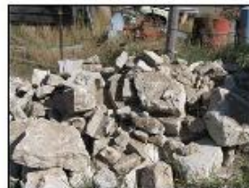
reuse - recycling