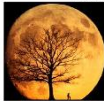
magic, Nature wisdom