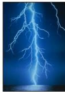
ecoAlchemy - transmutation