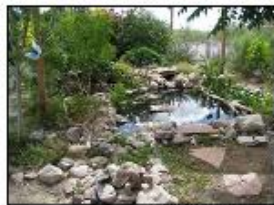
water birth, diversity