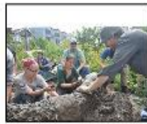
cob benches community