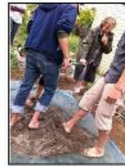
dance, new Nature rituals